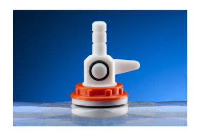
PTFE 1/4" Tap Valve Connector