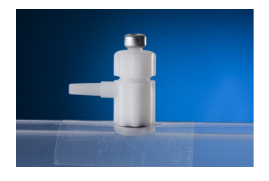
Polypropylene 3/16" Dual Use Connector